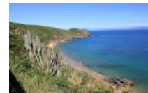
A Cultural Guide to Búzios: The Brazilian Saint Tropez