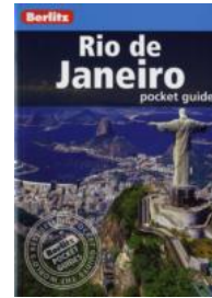
Rio De Janeiro Berlitz Pocket Guide