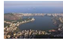
Rio de Janeiro's 10 Best Events and Festivals in Winter 2014