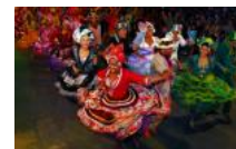
Festa Junina: Celebrating the Brazilian Harvest