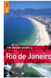
The Rough Guide to Rio de Janeiro Coates, Robert