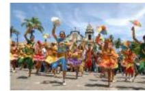
A Cultural Guide to Olinda: Contemporary Art and Carnival in Brazil