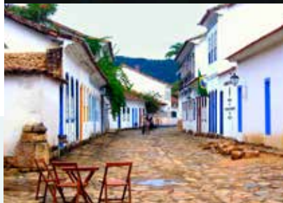
Above: Christ the Redeemer in Rio. Clockwise from right: the streets of Paraty. The Belmond Hotel das Cataratas. Houses on the river in Paraty

Finally, with the rainforest on your doorstep, fly to Foz do Iguacu (LAN or TAM airlines from Rio or São Paulo), the site of a spectacular waterfall twice as wide as Niagara Falls. The world-class Belmond Hotel das Cataratas ( www.hoteldascataratas.com ) is the only hotel located in the Iguacu National Park, which means exclusive exploration before the bus tours are let in at 9am, and a terrace that overlooks the torrents. With sumptuous suites and a painstaking attention to detail – cold towels, fruit smoothies and sun cream are brought to you poolside – it's little wonder the butterflies and toucans like to hang around. LUCY HALFHEAD AND HELENA LEE