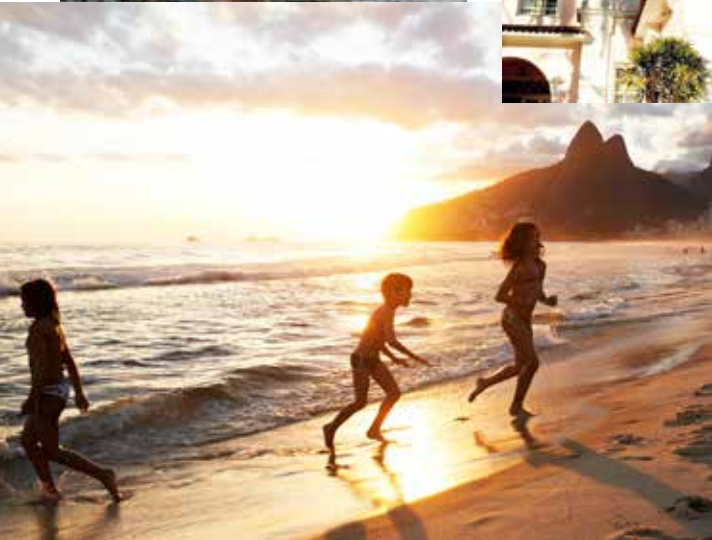
Left: children on the beach in Rio de Janeiro. Right: Iguacu Falls. Top right: Rio's coastline